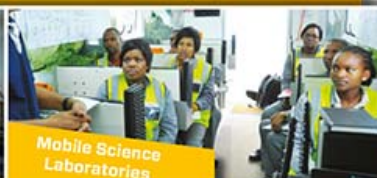
Mobile Science Laboratories