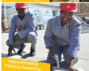
Apprenticeship Training Carpentry

The CDC remains one of the largest producers of skills in the Eastern Cape through various skills development programmes.