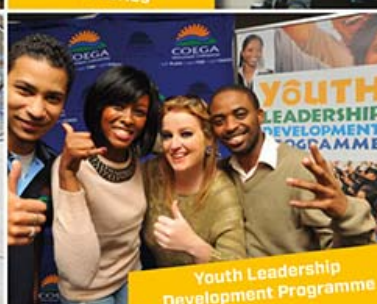
Youth Leadership Development Programme