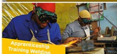
Apprenticeship Training Welding

Coega's Commitment to skilling job seekers for an Industrial future.