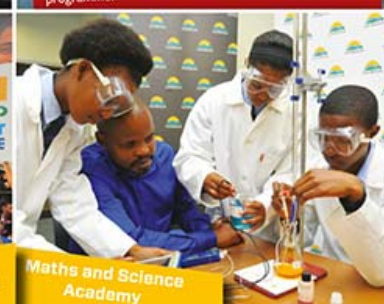
Maths and Science Academy

The Coega Development Corporation (CDC) is a beacon of hope for job seekers. It remains one of the largest producers of skills in the Eastern Cape through various programmes. Apprenticeship training opportunities through our Human Capital Solutions Business Unit, includes the Skills Development Programme. The CDC's Gateway to Opportunity webpage (G2O) features a variety of employment and training opportunities. Access the employment and training opportunities by simply registering on the G2O webpage ( www.g2o.co.za ) and start paving your way to life changing opportunities today.