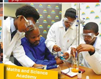
Maths and Science Academy

The Coega Development Corporation (CDC) is a beacon of hope for job seekers. It remains one of the largest producers of skills in the Eastern Cape through various programmes. Apprenticeship training opportunities through our Human Capital Solutions Business Unit, includes the Skills Development Programme. The CDC's Gateway to Opportunity webpage (G2O) features a variety of employment and training opportunities. Access the employment and training opportunities by simply registering on the G2O webpage ( www.g2o.co.za ) and start paving your way to life changing opportunities today.