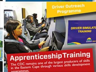
Driver Outreach Programme