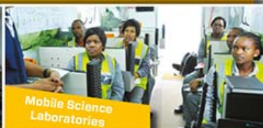
Mobile Science Laboratories