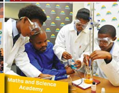
Maths and Science Academy

The Coega Development Corporation (CDC) is a beacon of hope for job seekers. It remains one of the largest producers of skills in the Eastern Cape through various programmes. Apprenticeship training opportunities through our Human Capital Solutions Business Unit, includes the Skills Development Programme. The CDC's Gateway to Opportunity webpage (G2O) features a variety of employment and training opportunities. Access the employment and training opportunities by simply registering on the G2O webpage ( www.g2o.co.za ) and start paving your way to life changing opportunities today.