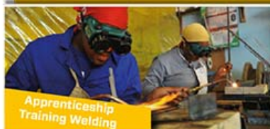
Apprenticeship Training Welding

#JobSeekers Coega's Commitment to skilling job seekers for an Industrial future.