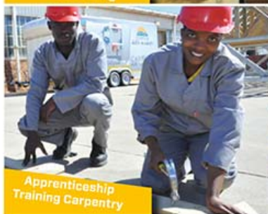
Apprenticeship Training Carpentry

The CDC remains one of the largest producers of skills in the Eastern Cape through various skills development programmes.