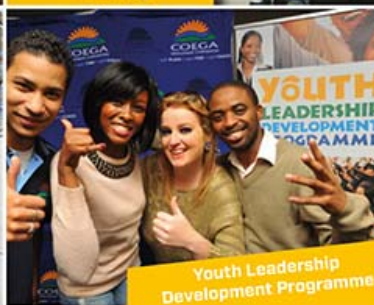
Youth Leadership Development Programme