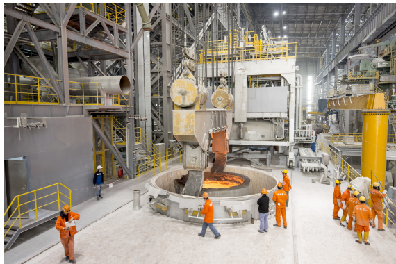
Successfully commissioned 150-ton VOD X-eeed facility at Fujian Fuxin Special Steel.

(32 lines of max. 65 characters per line)