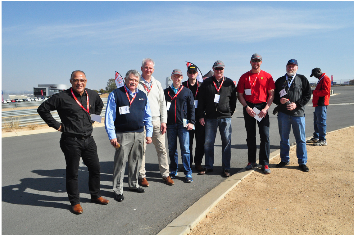
Contestants in last year's inaugural Speed in a Suit challenge hosted at TruckX by the SA Express Parcel Association

11 & 12 July 2018 Kyalami Grand Prix Circuit